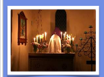
Holy Week at St Patrick's Church, Colebrook