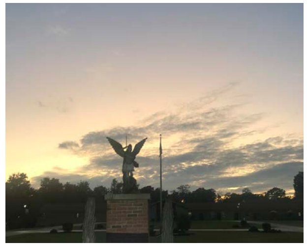
The statue of St Michael at Maria Stein Retreat Centre

days. So in our age of wilful darkness, the Lord establishes beacons of light, small communities who go about living their lives of true evangelical holiness. The light is there. Its brightness is no less for its being enshrouded in thick fog. But the fog will rise, and many will enter the way of life. Let those who encounter the light run now, let those who are blessed to have a guide in the way of holiness hold fast to it, and not let it go out, let those who are able, give their all to protect the hearth of the light they have discovered. In a dark night, even the smallest flickering light must be shielded, protected, fostered, that it may wax again into a burning furnace.