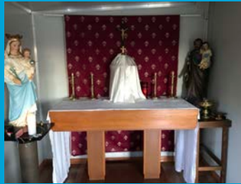
Our "new" chapel inside and out