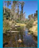
Some local "friends"