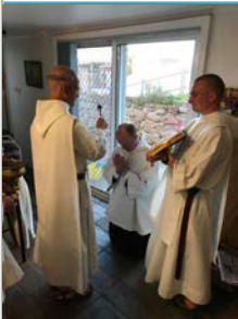
A new postulant